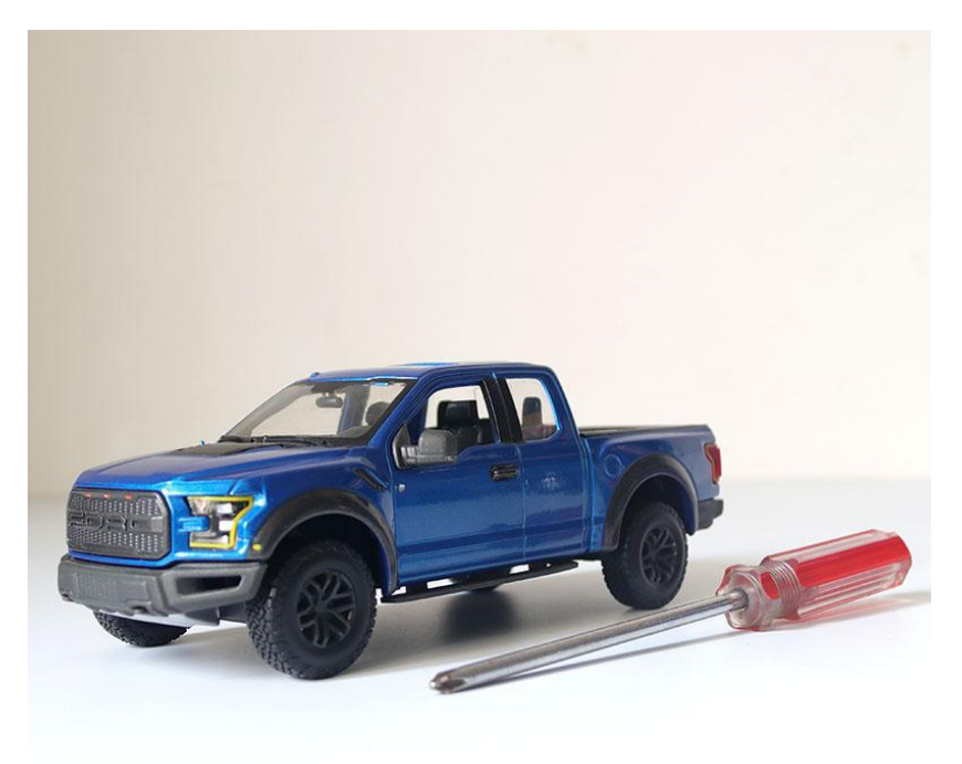
JDM-139 1/24 Rascal All Metal Scale Truck Chassis Set Instruction Sheet

The bodies shown in this manual are the <u>Maisto F150</u> and are only shown for example, they are neither included nor sold by RC4WD.